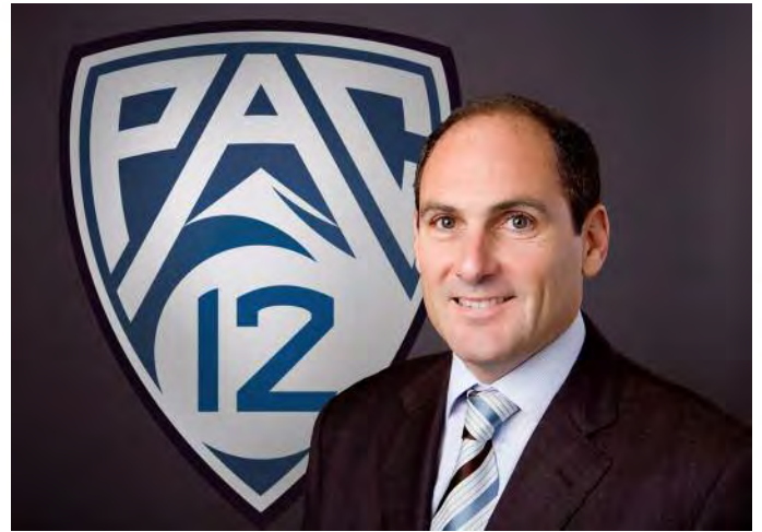
Pac-12 Commissioner Larry Scott

Colorado accepted its invitation to join the Pac-12 on June 11, 2010, as the Buffaloes were the first domino to fall in a change of the national landscape which, in just one week, saw Nebraska also leave the Big 12 and join the Big 10, Boise State depart the WAC for the Mountain West, TCU jump from the MWC for the Big East, and then on June 17, Utah agreeing to join CU to make it an even dozen in the Pac-12. Big-time rivals for the first half of the last century, the Buffaloes and Utes officially became the 11th and 12th members of the Conference on July 1, 2011, the first additions to the league since 1978. During the 33