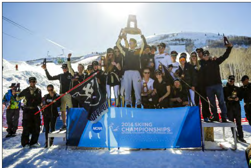
CU won its 20th national championship in skiing in March 2015