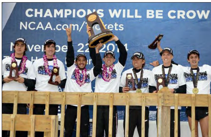
CU claimed its second straight NCAA cross country title in November 2014

Participation in the postseason was a common occurrence for the Pac-12 in 2014-15. Of the 22 sports sponsored, 20 witnessed at least half its teams participating in NCAA or other postseason action. The men sent 67 of a possible 97 teams into the postseason (69.1 percent), while the women sent 79 of a possible 115 teams (68.7 percent).